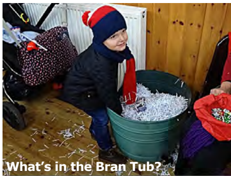
What's in the Bran Tub?

Finally a big thank you to all the volunteers and donations, without whose help and support this evening would not be possible.