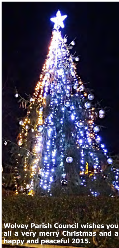
Wolvey Parish Council wishes you all a very merry Christmas and a happy and peaceful 2015.