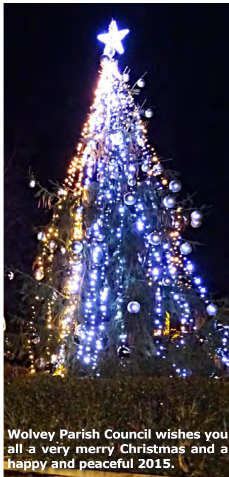
Wolvey Parish Council wishes you all a very merry Christmas and a happy and peaceful 2015.