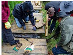
WEG volunteers get to grips with Boardwalk repairs.

Repair work commenced in mid June and is being undertaken by volunteers overseen by the contractors. It is hoped that the work will be completed before the summer is out, however, this is a voluntary effort and the Council is grateful for the level of patience shown so far by interested residents. We look forward to the Wetland being fully opened for the local community to enjoy in the not too distant future.