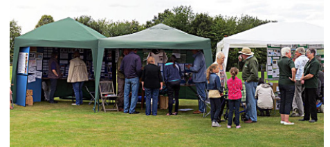
Council displays at the WPFT Produce Show

The Council's own stand focused on its role and achievements over the past twelve months.